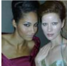
Model and Me