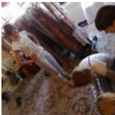
Planning out the girls