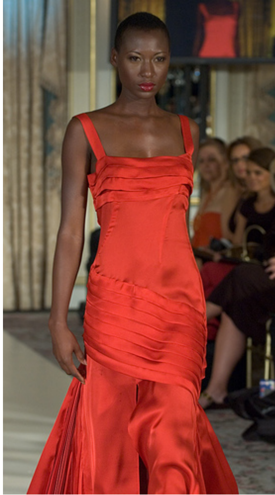
Taken in (See more photos here )