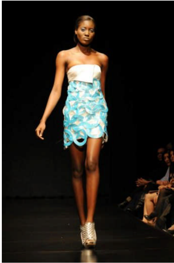
APPEALING DRESSES FROM NEW DESIGNER: Dany Atraché, (Lebanon), was featured in New York's Couture Fashion Week Fall 2009 Collection at The Waldorf-Astoria Hotel, Starlight Roof.